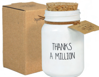
SKU: GL.MOCK.WH-1 Scent: Fresh Cotton Size: D.5 x H.8 cm Quantity: 8