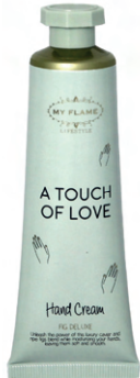
SKU: HC.009.02 Scent: Fig Deluxe Content: 50 ml Quantity: 8