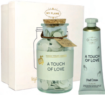
WY.GBSH.021.02 Scent: Minty Bamboo & Fig Deluxe Content: 50 gr & 50 ml Quantity: 4