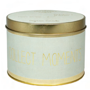
SKU: TIN.XL.GRN Scent: Minty Bamboo Size: D.12 x H.8 cm Quantity: 3