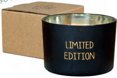
SKU: GL.MTC.XS.BLK Scent: Warm Cashmere Size: D7.5 x H.5. cm Quantity: 6