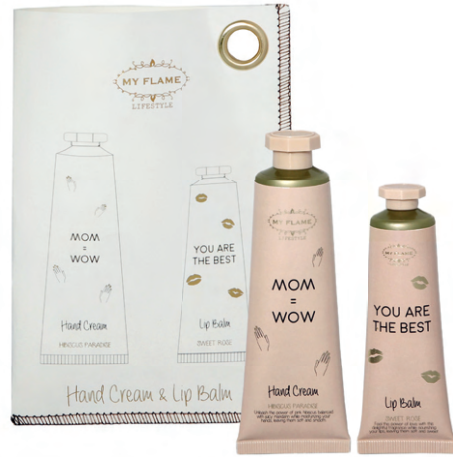
SKU: HC.009.04 Scent: Hibiscus Paradise & Sweet Rose Content: 50 ml & 30 ml Quantity: 4