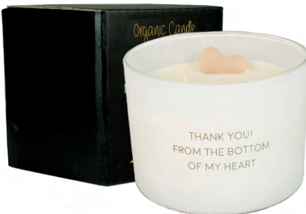
SKU: CH.017.06 Scent: Fresh Cotton Size: D.10.7 x H.8 cm Quantity: 4