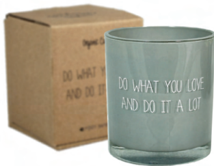
SKU: GL.CO.GRN Scent: Minty Bamboo Size: D.8 x H.9 cm Quantity: 4