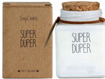
SKU: GL.SQ.WH Scent: Fresh Cotton Size: L.7 x B.7 x H.9 cm Quantity: 4