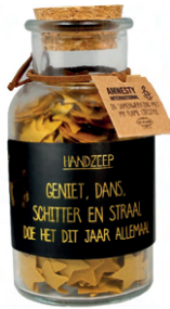
SKU: C2.2.149 Scent: Winter Glow Content: 50 gr. Quantity: 8