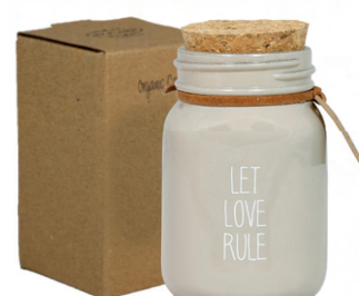
SKU: GL.MOCK.SND Scent: Fig's Delight Size: D.5 x H.8 cm Quantity: 8