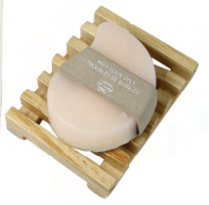
SKU: WWB.013.04 Scent: Oriental Vanilla Content: 128 gr. Quantity: 8