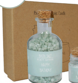
SKU: SO.BS.GB.06.GRN Scent: Minty Bamboo Content: 180 gr. salt and 40 gr. wax Quantity: 4