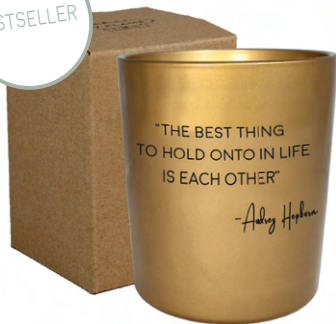
SKU: XBG.9010.MGO2 Scent: Silky Tonka Size: D.9 x H.10 cm Quantity: 4