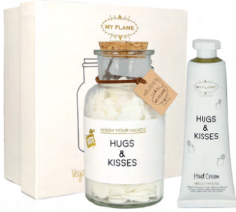
WY.GBSH.021.06 Scent: Fresh Cotton & Hibiscus Paradise Content: 50 gr & 50 ml Quantity: 4