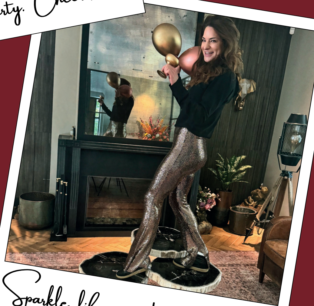
Sparkle life away! - xoxo -