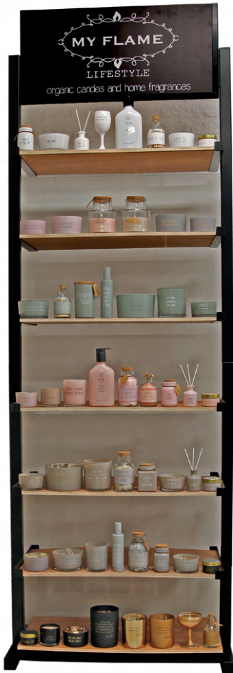
DISPLAY - 7 SHELVES Black frame with 7 shelves Size: W.80 x D.40 x H.215 cm