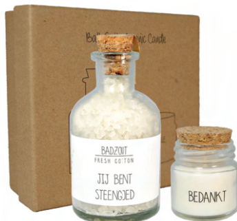
SKU: C2.2.151 Scent: Fresh Cotton Content: 180 gr. salt and 40 gr. wax Quantity: 4