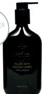
SKU: SO.GB350.XMAS Scent: Winter Glow Content: 350 ml Quantity: 6