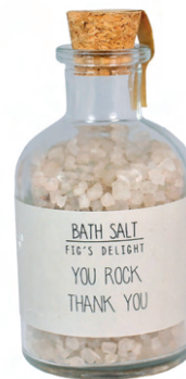
SKU: SO.BS.04.SND Scent: Fig's Delight Content: 180 gr. Quantity: 8