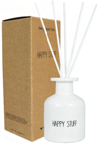
SKU: RD.WH.FL.HAPPY Scent: Fresh Lotus Content: 100 ml Quantity: 4