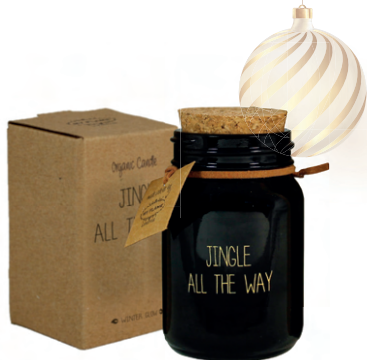
SKU: GL.MOCK.XMAS Scent: Winter Glow Size: D.5 x H.8 cm Quantity: 8