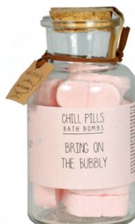
SKU: SO.BP.PI Scent: Green Tea Time Content: 128 gr. Quantity: 6