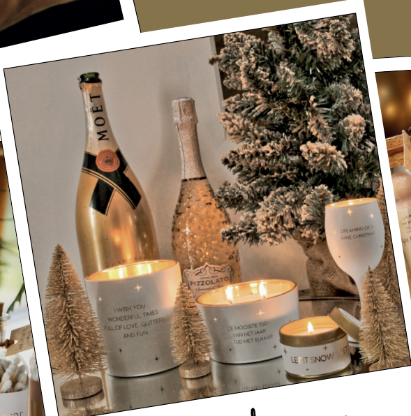
Dreaming of a whine x-mas