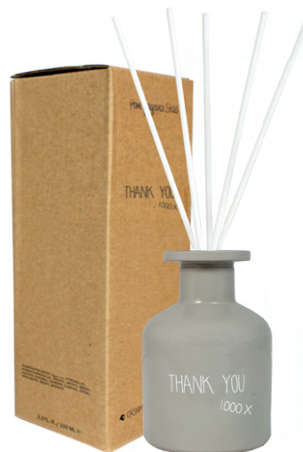
SKU: RD.SND.FD.THANK Scent: Fig Deluxe Content: 100 ml Quantity: 4