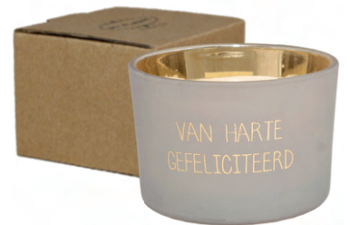
SKU: C2.2.141 Scent: Amber's Secret Size: D.7.5 x H.5 cm Quantity: 6