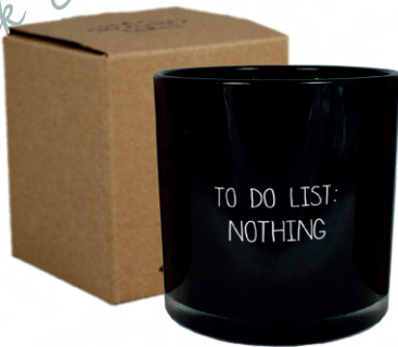
SKU: GL.1010.BL Scent: Warm Cashmere Size: D.10 x H.10 cm Quantity: 4