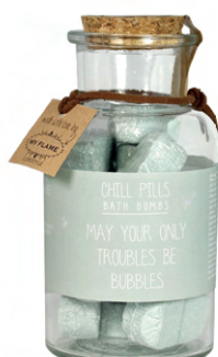
SKU: SO.BP.GRN Scent: Minty Bamboo Content: 128 gr. Quantity: 6