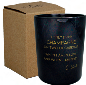
SKU: XBG.1012.SBL7 Scent: Warm Cashmere Size: D.10 x H.12 cm Quantity: 4