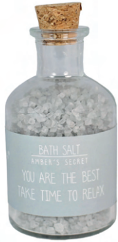
SKU: SO.BS.01.LGRY Scent: Amber's Secret Content: 180 gr. Quantity: 8