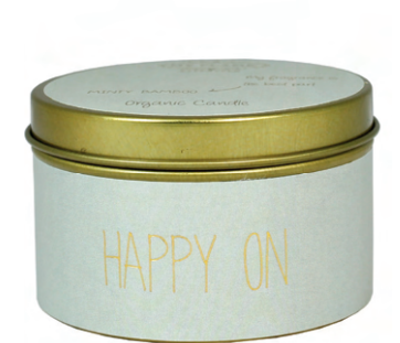
SKU: TIN.M.GRN.HAPPYON Scent: Minty Bamboo Size: D.8 x H.5 cm Quantity: 4