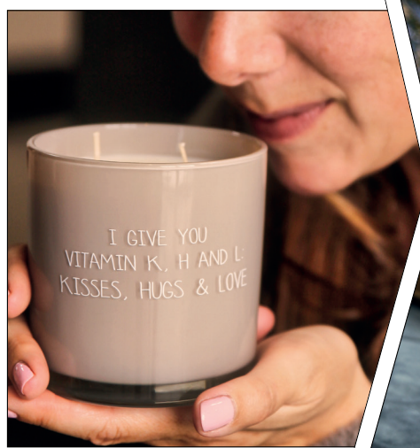
The smell of kisses, hugs &