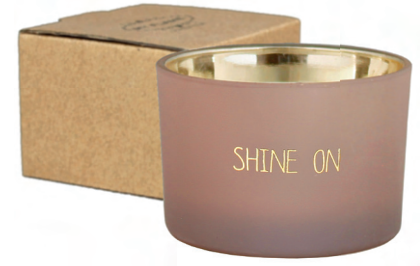
SKU: GL.MTC.XS.SND Scent: Fig's Delight Size: D.7.5 x H.5 cm Quantity: 6