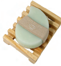
SKU: WWB.013.02 Scent: Lemon Verbena Content: 128 gr. Quantity: 8