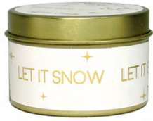
SKU: XMAS.015.06D Scent: Winter Wood Size: D.6 x H.4 cm Quantity: 12