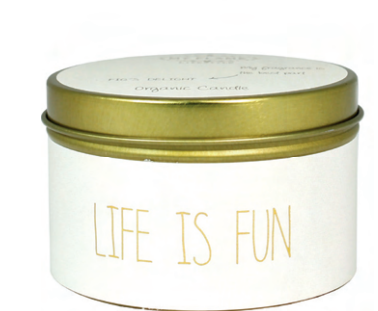
SKU: TIN.M.SND.FUN Scent: Fig's Delight Size: D.8 x H.5 cm Quantity: 4