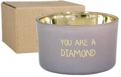
SKU: GL.MTC.GRY Scent: Amber's Secret Size: D.9 x H.5 cm Quantity: 4