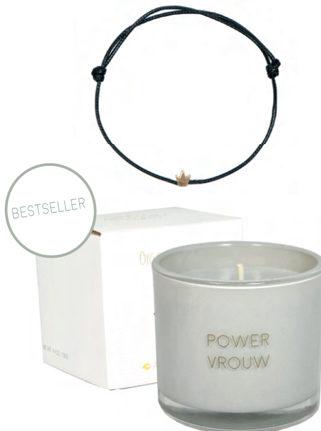
SKU: WBR.006.03 Scent: Amber's Secret Size: D.7 x H.6 cm Quantity: 4