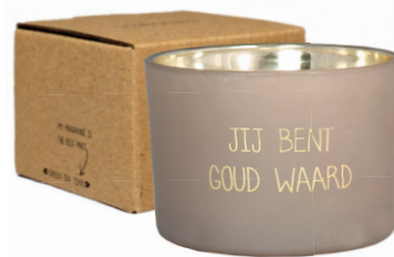
SKU: C2.2.132 Scent: Fig's Delight Size: D.7.5 x H.5 cm Quantity: 6