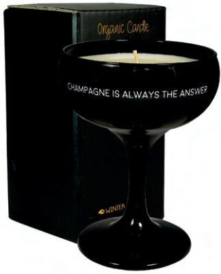
SKU: GL.WI.007.01 Scent: Warm Cashmere Size: D.8 x H.11 cm Quantity: 4