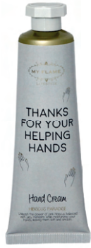
SKU: HC.009.03 Scent: Hibiscus Paradise Content: 50 ml Quantity: 8