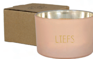
SKU: C2.2.131 Scent: Green Tea Time Size: D.7.5 x H.5 cm Quantity: 6