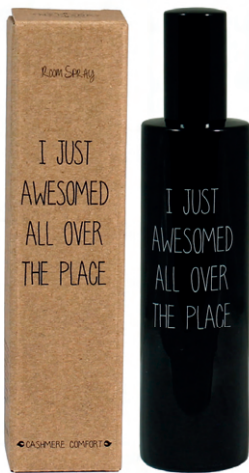
SKU: RS.BL.CC Scent: Cashmere Comfort Content 100 ml Quantity: 4