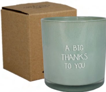
SKU: GL.1010.GRN Scent: Minty Bamboo Size: D.10 x H.10 cm Quantity: 4