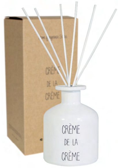
SKU: RD.XL.WH.FL.CREME Scent: Fresh Lotus Content: 190 ml Quantity: 3