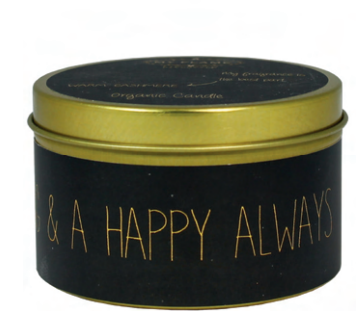
SKU: TIN.M.BL.HAPPYALWAYS Scent: Warm Cashmere Size: D.8 x H.5 cm Quantity: 4