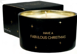
SKU: XMAS.015.01C Scent: Winter Wood Size: D.9 x H.5 cm Quantity: 4