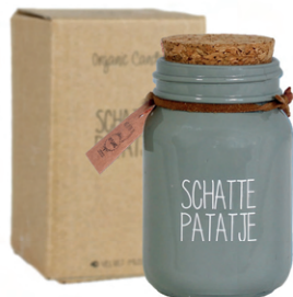
SKU: GL.MOCK.GRN Scent: Minty Bamboo Size: D.5 x H.8 cm Quantity: 8