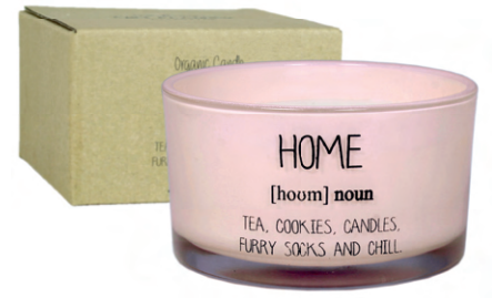
SKU: GL.WW.PI Scent: Green Tea Time Size: D.9 x H.5 cm Quantity: 4