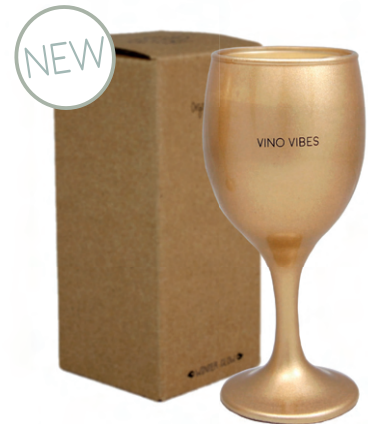
SKU: GL.WI.GLD Scent: Silky tonka Size: D.5.5 x H.13 cm Quantity: 4