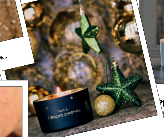
Under the mistletoe