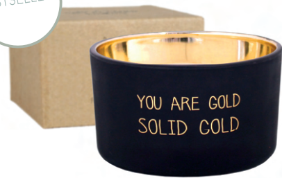
SKU: GL.MTC.BL Scent: Warm Cashmere Size: D.9 x H.5 cm Quantity: 4