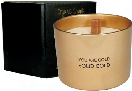
SKU: CH.017.07 Scent: Silky Tonka Size: D.10.7 x H.8 cm Quantity: 4

We just love to add something fun to our candles. These candle feature a charm made of wax. Just light the candle and the charm will eventually melt away.