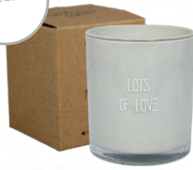
SKU: GL.CO.LGRY Scent: Amber's Secret Size: D.8 x H.9 cm Quantity: 4