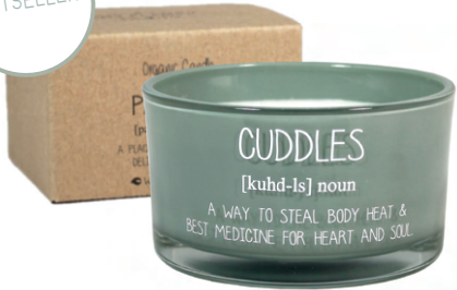
SKU: GL.WW.GRN Scent: Minty Bamboo Size: D.9 x H.5 cm Quantity: 4