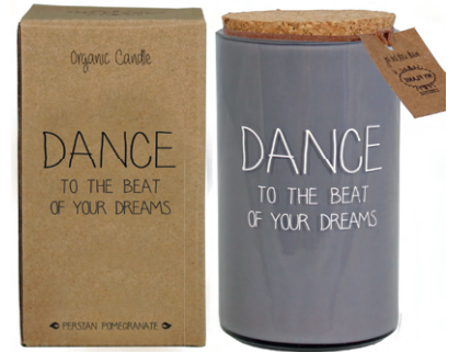
SKU: GL.RND.DGRY Scent: Persian Pomegranate Size: D.7 x H.12 cm Quantity: 4