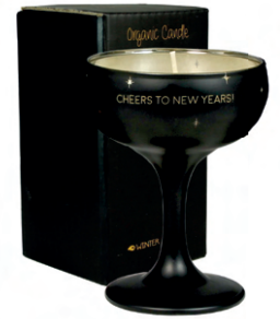
SKU: XMAS.015.01B Scent: Winter Wood Size: D.8 x H.11 cm Quantity: 4