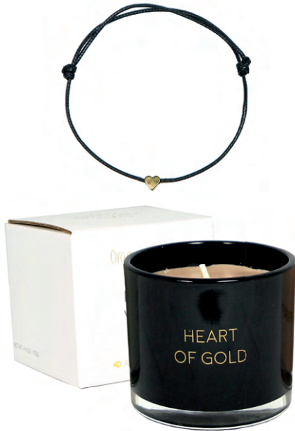
SKU: WBR.006.01 Scent: Warm Cashmere Size: D.7 x H.6 cm Quantity: 4