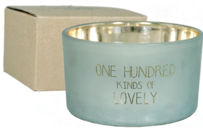
SKU: GL.MTC.GRN Scent: Minty Bamboo Size: D.9 x H.5 cm Quantity: 4