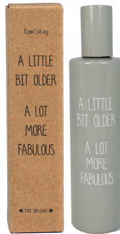
SKU: RS.SND.FD.LITTLE Scent: Fig Deluxe Content: 100 ml Quantity: 4