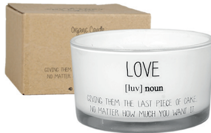
SKU: GL.WW.WH Scent: Fresh Cotton Size: D.9 x H.5 cm Quantity: 4