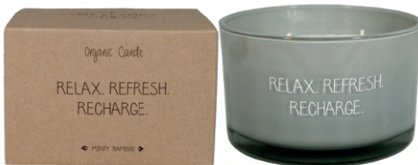
SKU: GL.XL.GRN Scent: Minty Bamboo Size: D.13 x H.8 cm Quantity: 3