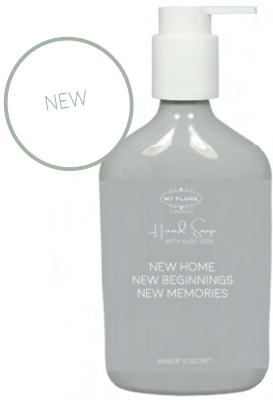
SKU: SO.GB350.LGRY-1 Scent: Amber's Secret Content: 350 ml Quantity: 6