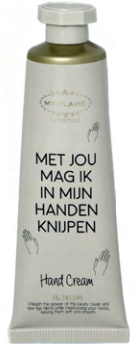
SKU: HC.009.05 Scent: Fig Deluxe Content: 50 ml Quantity: 8