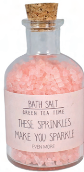
SKU: SO.BS.03.PI Scent: Green Tea Time Content: 180 gr. Quantity: 8