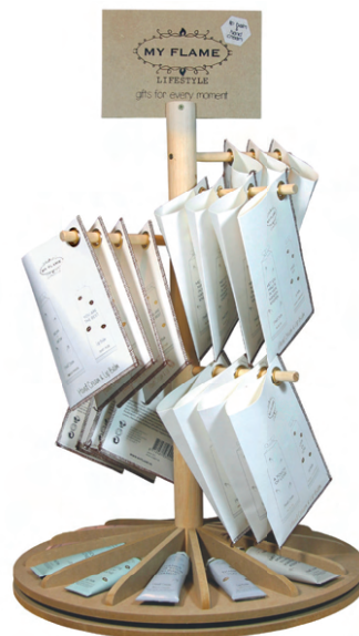
SKU: LH.GB.DIS Space for: 5 x 4 giftbags Size: DIA. 40 x H.70 cm