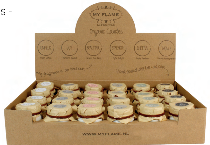
SKU: tray.24.miniT Size: L.34 x B.24 x H.26 cm Quantity: 1 1 tray contains 24 candles