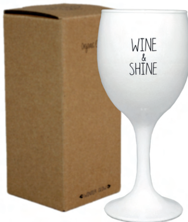
SKU: GL.WI.L.WH Scent: Fresh Cotton Size: D.7 x H.15 cm Quantity: 4