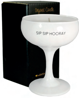
SKU: GL.WI.007.06 Scent: Fresh Cotton Size: D.8 x H.11 cm Quantity: 4