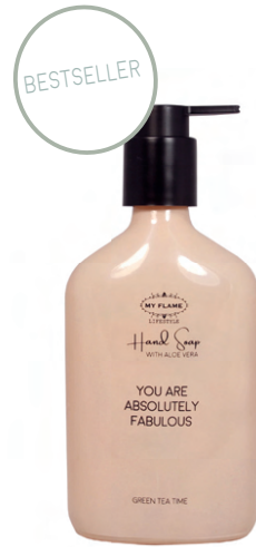
SKU: SO.GB350.PI Scent: Green Tea Time Content: 350 ml Quantity: 6