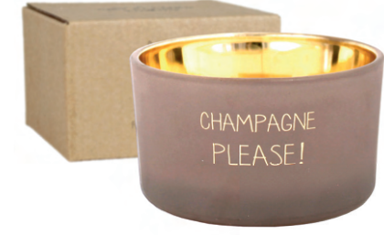
SKU: GL.MTC.SD Scent: Fig's Delight Size: D.9 x H.5 cm Quantity: 4