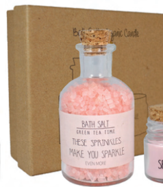
SKU: SO.BS.GB.08.PI Scent: Green Tea Time Content: 180 gr. salt and 40 gr. wax Quantity: 4