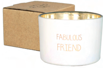
SKU: GL.MTC.XS.WH Scent: Fresh Cotton Size: D.7.5 x H.5 cm Quantity: 6