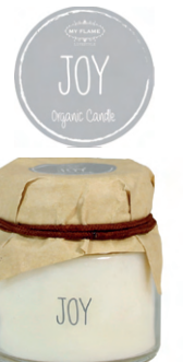
SKU: miniT.4.joy.lg Scent: Amber's Secret Size: D.4.5 x H.5 cm Quantity: 12