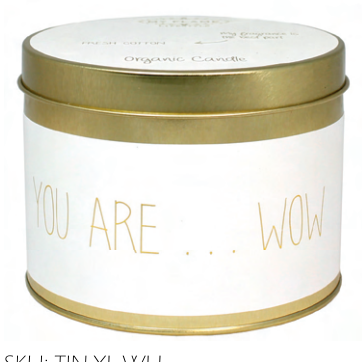
SKU: TIN.XL.WH Scent: Fresh Cotton Size: D.12 x H.8 cm Quantity: 3