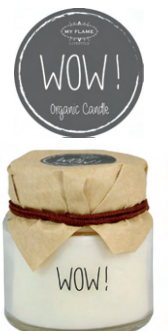
SKU: miniT.1.wow.dg Scent: Persian Pomegranate Size: D.4.5 x H.5 cm Quantity: 12

Meet our mini's. Just a little something for any occasion. Mix and match or just take one. Before you know it, your tray is gone.