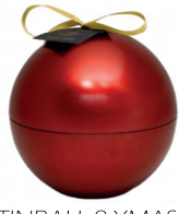
SKU: TINBALL.9.XMAS.RED Scent: Winter Glow Size: L.9 x B.9 x H.9 cm Quantity: 6