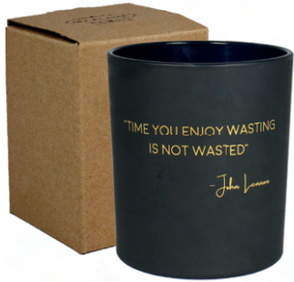
SKU: XBG.9010.MBL1 Scent: Warm Cashmere Size: D.9 x H.10 cm Quantity: 4