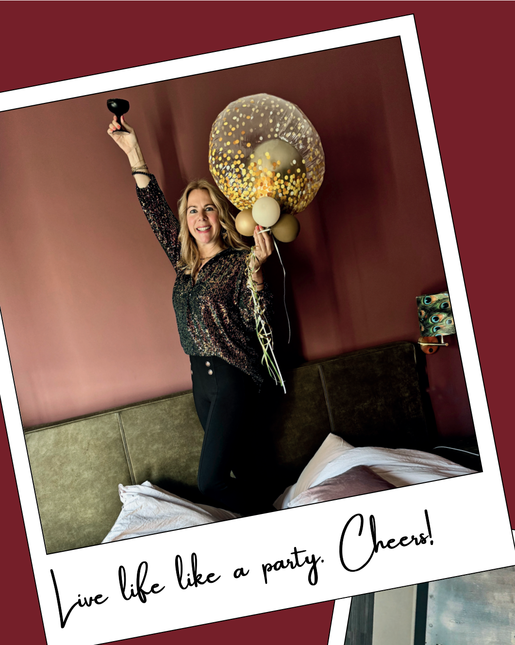
Live life like a party. Cheers!