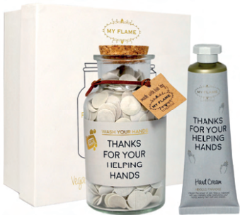
WY.GBSH.021.03 Scent: Amber's Secret & Hibiscus Paradise Content: 50 gr & 50 ml Quantity: 4