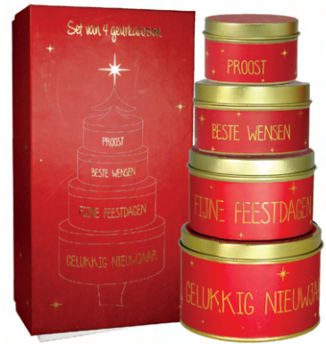
SKU: C2.2.300 Scent: Winter Glow Size: D.9 x H.6 cm, D.8 x H.5 cm, D.7 x H.4 cm, D.6 x H.4 cm Quantity: 4