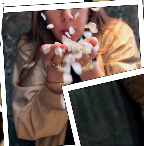
Confetti is always