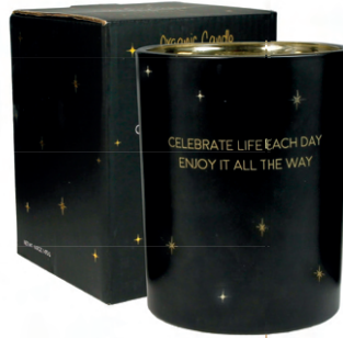
SKU: XMAS.015.01A Scent: Winter Wood D.10 x H.12.5 cm Quantity: 4