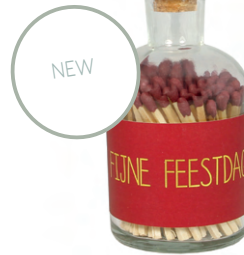
SKU: MTCH.XMAS.24 Size bottle: D.6 x H.10.5 cm Content: 80 matches Quantity: 8