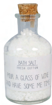
SKU: SO.BS.05.WH Scent: Fresh Cotton Content: 180 gr. Quantity: 8