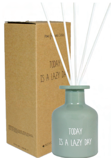
SKU: RD.GRN.BB.LAZY Scent: Botanical Bamboo Content: 100 ml Quantity: 4