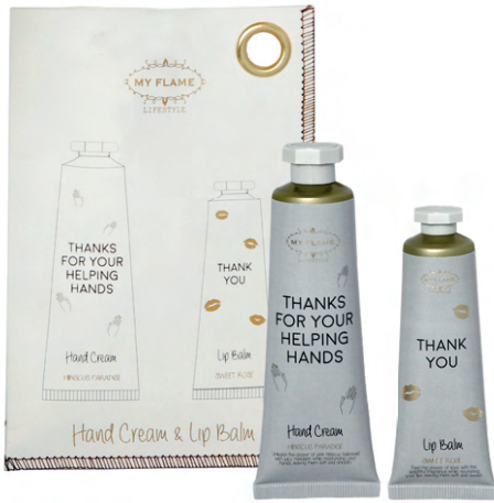
SKU: HC.009.03 Scent: Hibiscus Paradise & Sweet Rose Content: 50 ml & 30 ml Quantity: 4