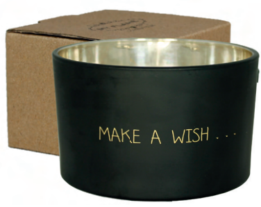
SKU: GL.MTC.XL.BL Scent: Warm Cashmere Size: D.13 x H.8 cm Quantity: 4