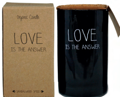
SKU: GL.RND.BL Scent: Warm Cashmere Size: D.7 x H.12 cm Quantity: 4