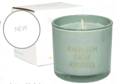
SKU: C2.2.316 Scent: Minty Bamboo Size: D.7 x H.6 cm Quantity: 4