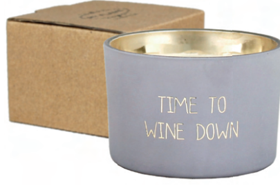
SKU: GL.MTC.XS.LGRY Scent: Amber's Secret Size: D.7.5 x H.5 cm Quantity: 6