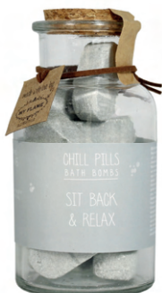
SKU: SO.BP.LGRY Scent: Amber's Secret Content: 128 gr. Quantity: 6