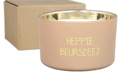
SKU: GL.MTC.PI Scent: Green Tea Time Size: D.9 x H.5 cm Quantity: 4