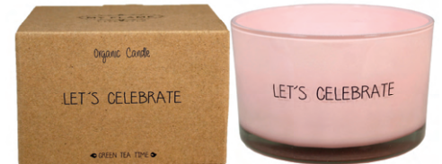
SKU: GL.XL.PI Scent: Green Tea Time Size: D.13 x H.8 cm Quantity: 3