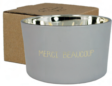
SKU: GL.MTC.XL.LGRY Scent: Amber's Secret Size: D.13 x H.8 cm Quantity: 4