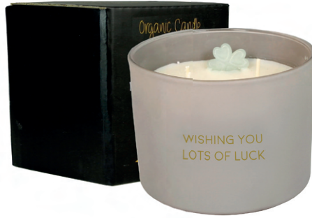
SKU: CH.017.03 Scent: Amber's Secret Size: D.10.7 x H.8 cm Quantity: 4