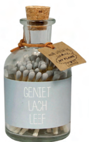
SKU: MTCH.LGRY Size bottle: D.6 x H.10.5 cm Content: 80 matches Quantity: 8