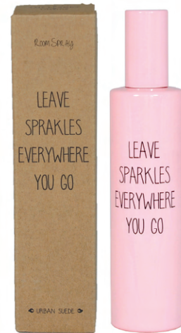
SKU: RS.PI.US Scent: Urban Suede Content: 100 ml Quantity: 4