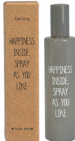
SKU: RS.LG.FB Scent: Flower Bomb Content 100 ml Quantity: 4