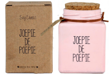
SKU: GL.SQ.PI Scent: Green Tea Time Size: L.7 x B.7 x H.9 cm Quantity: 4