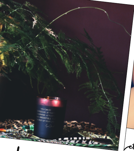
vs. charming and irresistable