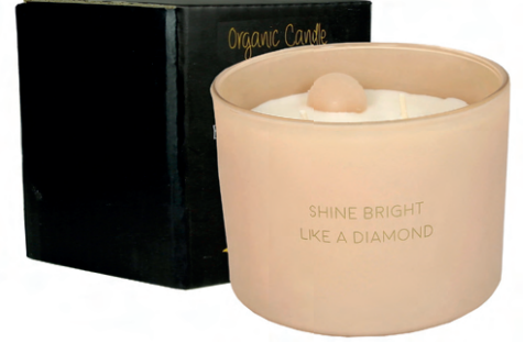
SKU: CH.017.04 Scent: Green Tea Time Size: D.10.7 x H.8 cm Quantity: 4