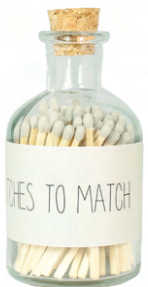
SKU: MTCH.SND Size bottle: D.6 x H.10.5 cm Content: 80 matches Quantity: 8