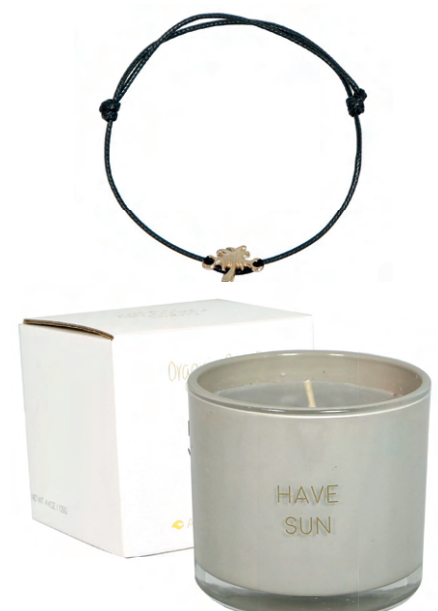
SKU: WBR.006.05 Scent: Fig's Delight Size: D.7 x H.6 cm Quantity: 4