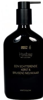
SKU: C2.2.152 Scent: Winter Glow Content: 350 ml Quantity: 6