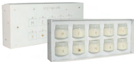
SKU: GB.XMAS.WH.06 Scent: Winter Glow Size: 10 pcs of D.4.3 x H.4 cm Quantity: 4