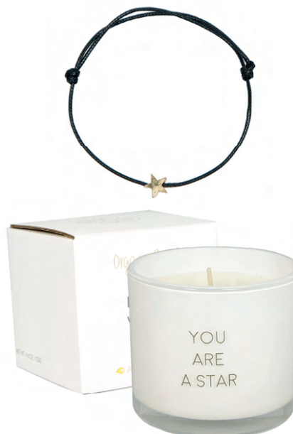
SKU: WBR.006.06 Scent: Fresh Cotton Size: D.7 x H.6 cm Quantity: 4