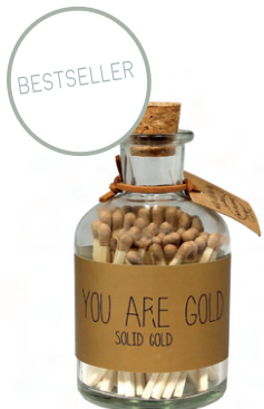
SKU: MTCH.GLD Size bottle: D.6 x H.10.5 cm Content: 80 matches Quantity: 8