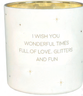
SKU: XMAS.015.06B Scent: Winter Wood Size: D.10 x H.10 cm Quantity: 4