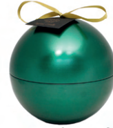
SKU: TINBALL.9.XMAS.GRN Scent: Winter Glow Size: L.9 x B.9 x H.9 cm Quantity: 6