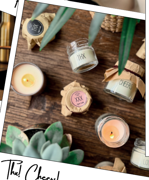
Thx! Cheers! -xxx-