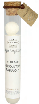
SKU: WSS.012.06 Scent: Cashmere Bliss Content: 42 gr. Quantity: 6