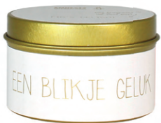
SKU: C2.2.110-2 Scent: Fig's Delight Size: D.6 x H.4 cm Quantity: 12