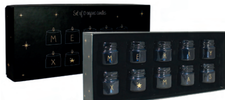
SKU: GB.XMAS.BL.05 Scent: Winter Glow Size: 10 pcs of D.4.3 x H.4 cm Quantity: 4