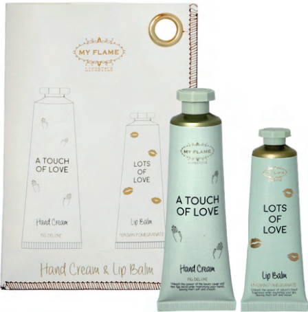
SKU: HC.009.02 Scent: Fig Deluxe & Persian Pomegranate Content: 50 ml & 30 ml Quantity: 4