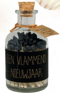
SKU: MTCH.XMAS Size bottle: D.6 x H.10.5 cm Content: 80 matches Quantity: 8