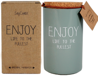
SKU: GL.RND.GRN Scent: Minty Bamboo Size: D.7 x H.12 cm Quantity: 4