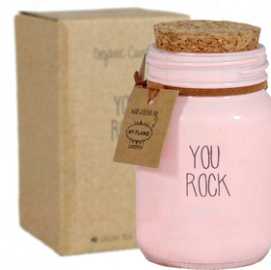
SKU: GL.MOCK.PI Scent: Green Tea Time Size: D.5 x H.8 cm Quantity: 8