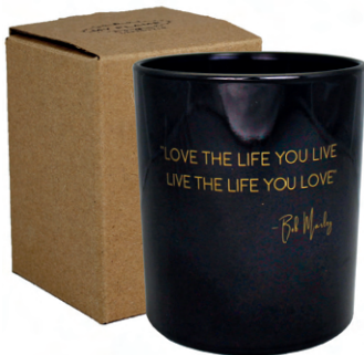
SKU: XBG.9010.SBL3 Scent: Warm Cashmere Size: D.9 x H.10 cm Quantity: 4