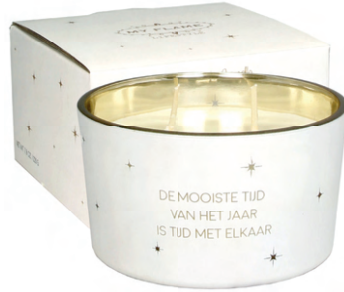
SKU: XMAS.015.06C Scent: Winter Wood Size: D.11 x H.6 cm Quantity: 4