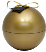
SKU: TINBALL.9.XMAS.GLD Scent: Winter Glow Size: L.9 x B.9 x H.9 cm Quantity: 6