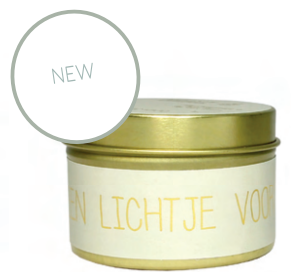
SKU: C2.2.314 Scent: Minty Bamboo Size: D.6 x H.4 cm Quantity: 12