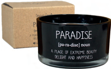
SKU: GL.WW.BL Scent: Warm Cashmere Size: D.9 x H.5 cm Quantity: 4