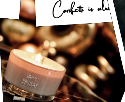
For the love of g