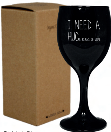
SKU: GL.WI.L.BL Scent: Warm Cashmere Size: D.7 x H.15 cm Quantity: 4