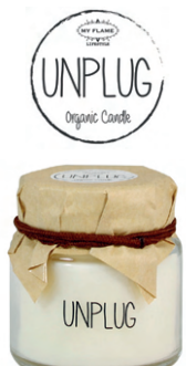
SKU: miniT.3.unplug.wh Scent: Fresh Cotton Size: D.4.5 x H.5 cm Quantity: 12