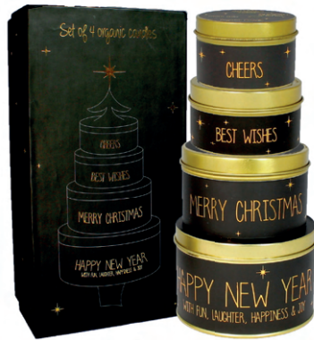
SKU: GB.TIN4.XMAS.BL Scent: Winter Glow Size: D.9 x H.6 cm, D.8 x H.5 cm, D.7 x H.4 cm, D.6 x H.4 cm Quantity: 4