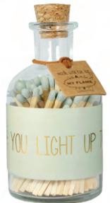
SKU: MTCH.GRN Size bottle: D.6 x H.10.5 cm Content: 80 matches Quantity: 8