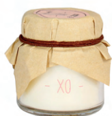
SKU: C2.2.130 Scent: Green Tea Time Size: D.4.5 x H.5 cm Quantity: 12