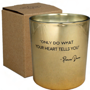
SKU: XBG.9010.SG04 Scent: Silky Tonka Size: D.9 x H.10 cm Quantity: 4