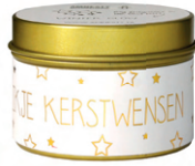
SKU: C2.2.136 Scent: Winter Glow Size: D.6 x H.4 cm Quantity: 12