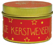
SKU: C2.2.143 Scent: Winter Glow Size: D.6 x H.4 cm Quantity: 12