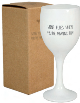
SKU: GL.WI.WH.FLY Scent: Fresh Cotton Size: D.5.5 x H.13 cm Quantity: 4