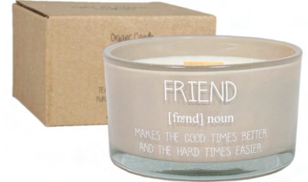
SKU: GL.WW.SND Scent: Fig's Delight Size: D.9 x H.5 cm Quantity: 4