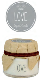
SKU: mini.4.love.lg Scent: Amber's Secret Size: D.4.2 x H.3.8 cm Quantity: 12