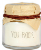
SKU: C2.2.129 Scent: Fig's Delight Size: D.4.5 x H.5 cm Quantity: 12