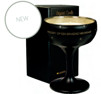
SKU: C2.2.311 Scent: Winter Wood Size: D.8 x H.11 cm Quantity: 4