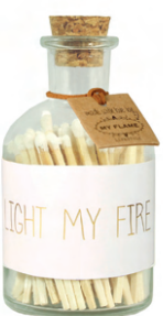
SKU: MTCH.WH Size bottle: D.6 x H.10.5 cm Content: 80 matches Quantity: 8