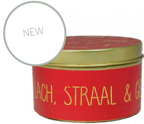
SKU: TIN.M.XMAS.24A Scent: Winter Glow Size: D.8 x H.5 cm Quantity: 4