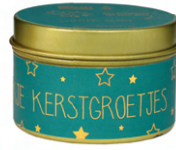
SKU: C2.2.137 Scent: Winter Glow Size: D.6 x H.4 cm Quantity: 12