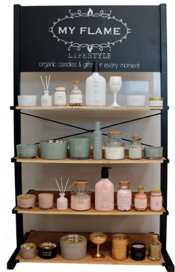
DISPLAY - 4 SHELVES Black frame with 4 shelves Size: W.76 x D.40 x H.125 cm