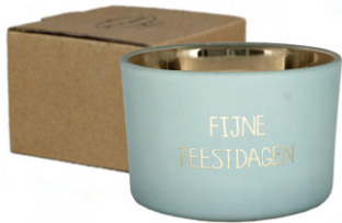
SKU: C2.2.142 Scent: Winter Glow Size: D.7.5 x H.5 cm Quantity: 6