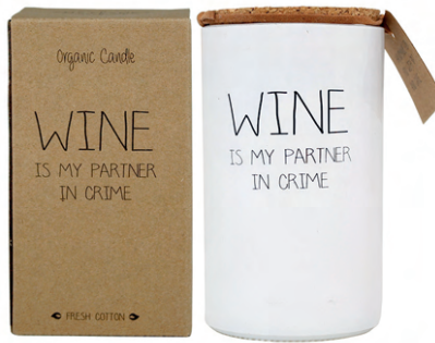
SKU: GL.RND.WH Scent: Fresh Cotton Size: D.7 x H.12 cm Quantity: 4