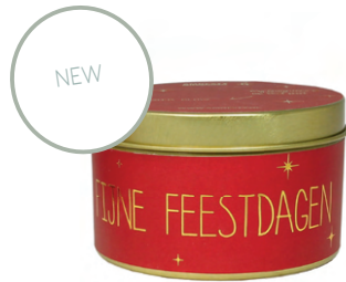
SKU: TIN.M.XMAS.24B Scent: Winter Glow Size: D.8 x H.5 cm Quantity: 4