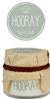
SKU: mini.5.hooray.grn Scent: Minty Bamboo Size: D.4.2 x H.3.8 cm Quantity: 12