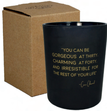
SKU: XBG.1012.MBL5 Scent: Warm Cashmere Size: D.10 x H.12 cm Quantity: 4