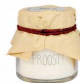
SKU: C2.2.140 Scent: Amber's Secret Size: D.4.5 x H.5 cm Quantity: 12