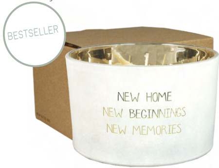
SKU: GL.MTC.XL.WH Scent: Fresh Cotton Size: D.13 x H.8 cm Quantity: 4