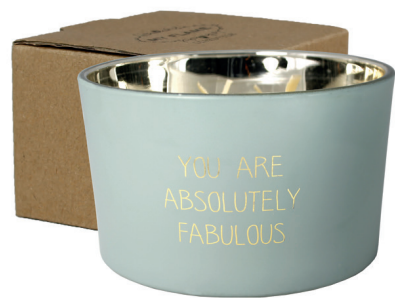
SKU: GL.MTC.XL.GRN Scent: Minty Bamboo Size: D.13 x H.8 cm Quantity: 4