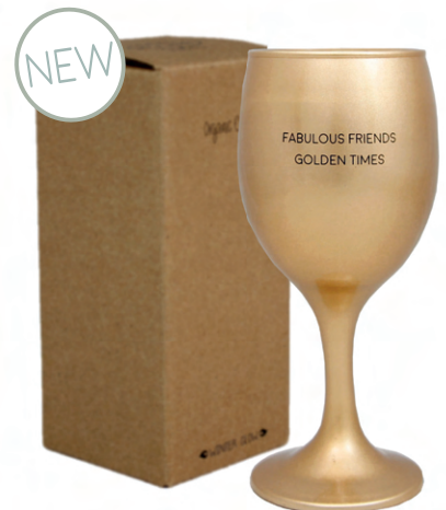
SKU: GL.WI.L.GLD Scent: Silky Tonka Size: D.7 x H.15 cm Quantity: 4