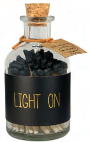
SKU: MTCH.BL Size bottle: D.6 x H.10.5 cm Content: 80 matches Quantity: 8