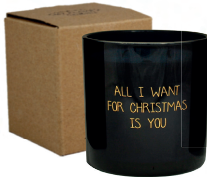
SKU: GL.1010.XMAS Scent: Winter Glow Size: D.10 x H.10 cm Quantity: 4