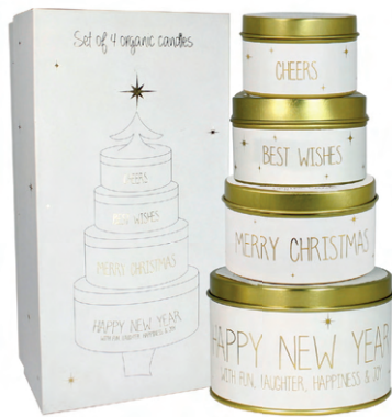
SKU: GB.TIN4.XMAS.WH Scent: Winter Glow Size: D.9 x H.6 cm, D.8 x H.5 cm, D.7 x H.4 cm, D.6 x H.4 cm Quantity: 4