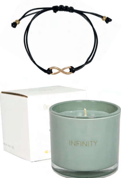
SKU: WBR.006.02 Scent: Minty Bamboo Size: D.7 x H.6 cm Quantity: 4