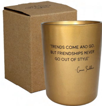
SKU: XBG.1012.MGO6 Scent: Silky Tonka Size: D.10 x H.12 cm Quantity: 4