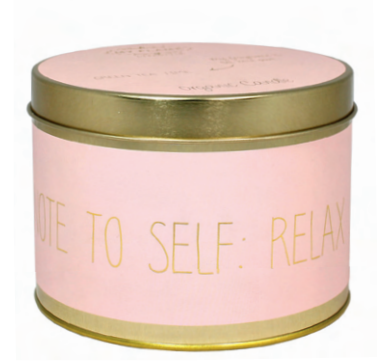
SKU: TIN.XL.PI Scent: Green Tea Time Size: D.12 x H.8 cm Quantity: 3