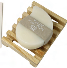
SKU: WWB.013.06 Scent: Cashmere Bliss Content: 128 gr. Quantity: 8