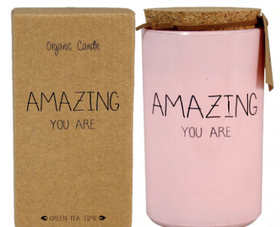
SKU: GL.RND.PI Scent: Green Tea Time Size: D.7 x H.12 cm Quantity: 4