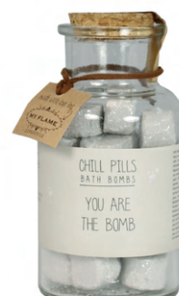
SKU: SO.BP.SND Scent: Fig's Delight Content: 128 gr. Quantity: 6