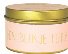
SKU: C2.2.128 Scent: Warm Cashmere Size: D.6 x H.4 cm Quantity: 12