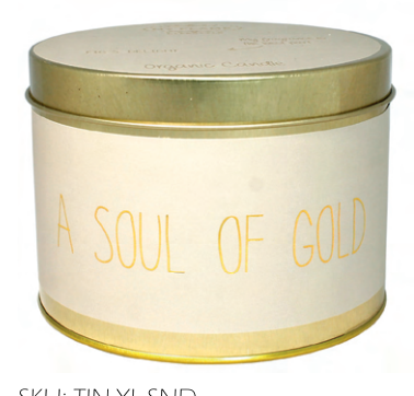
SKU: TIN.XL.SND Scent: Fig's Delight Size: D.12 x H.8 cm Quantity: 3