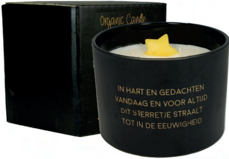
SKU: CH.017.01 Scent: Warm Cashmere Size: D.10.7 x H.8 cm Quantity: 4