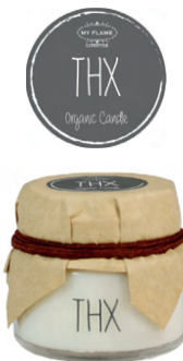
SKU: mini.1.thx.dg Scent: Persian Pomegranate Size: D.4.2 x H.3.8 cm Quantity: 12