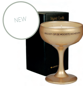
SKU: C2.2.310 Scent: Silky Tonka Size: D.8 x H.11 cm Quantity: 4