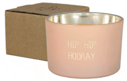
SKU: GL.MTC.XS.PI Scent: Green Tea Time Size: D.7.5 x H.5 cm Quantity: 6