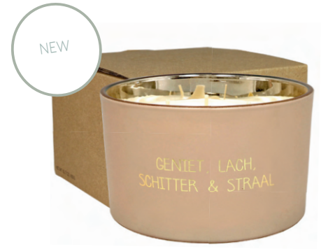
SKU: GL.MTC.XL.PI-1 Scent: Green Tea Time Size: D.13 x H.8 cm Quantity: 4