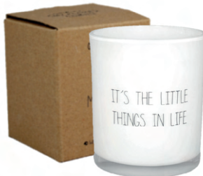
SKU: GL.CO.WH-I Scent: Fresh Cotton Size: D.8 x H.9 cm Quantity: 4