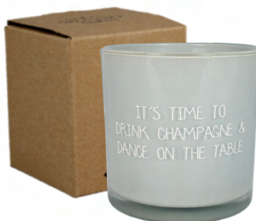
SKU: GL.1010.LGRY Scent: Amber's Secret Size: D.10 x H.10 cm Quantity: 4