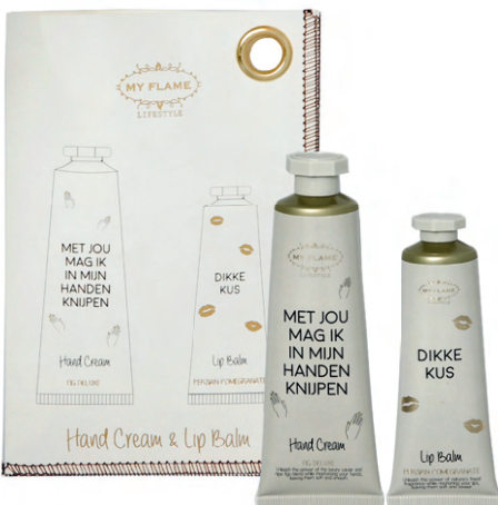
SKU: HC.009.05 Scent: Fig Deluxe & Persian Pomegranate Content: 50 ml & 30 ml Quantity: 4