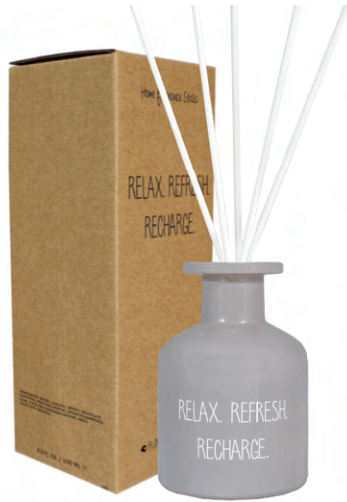
SKU: RD.GR.FB.RELAX Scent: Flower Bomb Content: 100 ml Quantity: 4