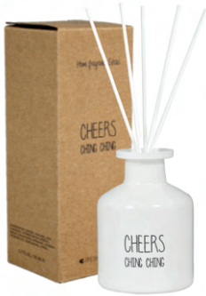
SKU: RD.XS.WH.FL.CHEERS Scent: Fresh Lotus Content: 50 ml Quantity: 6