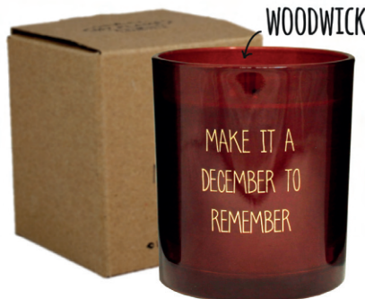
SKU: GL.CO.RED.XMAS Scent: Winter Wood Size: D.8 x H.9 cm Quantity: 4