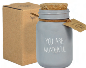
SKU: GL.MOCK.LG Scent: Amber's Secret Size: D.5 x H.8 cm Quantity: 8