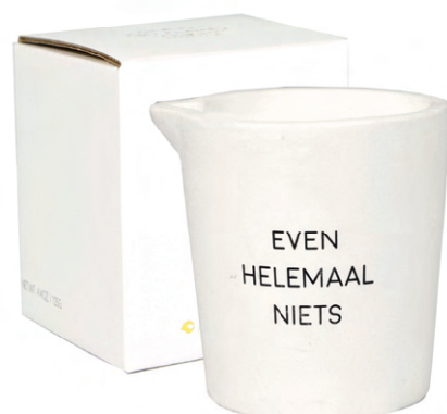
SKU: MA.016.06C Scent: Relaxing Chamomile Size: D.6.5 x H.7 cm Quantity: 6