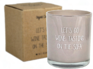
SKU: GL.CO.SA Scent: Fig's Delight Size: D.8 x H.9 cm Quantity: 4