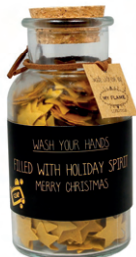
SKU: SO.BLK.07 Scent: Winter Glow Content: 50 gr. Quantity: 8