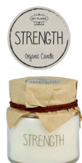
SKU: miniT.6.strength.snd Scent: Fig's Delight Size: D.4.5 x H.5 cm Quantity: 12