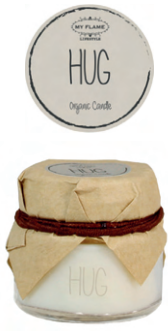
SKU: mini.6.hug.snd Scent: Fig's Delight Size: D.4.2 x H.3.8 cm Quantity: 12