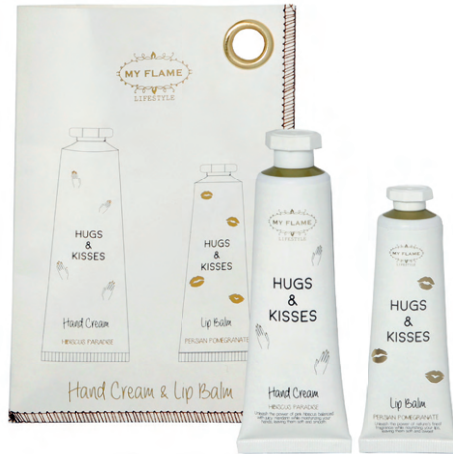
SKU: LH.GB.011.06 Scent: Hibiscus Paradise & Persian Pomegranate Content: 50 ml & 30 ml Quantity: 4