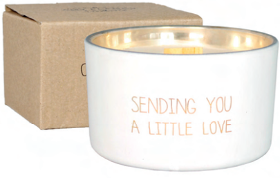
SKU: GL.MTC.WH Scent: Fresh Cotton Size: D.9 x H.5 cm Quantity: 4