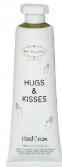
SKU: HC.009.06 Scent: Hibiscus Paradise Content: 50 ml Quantity: 8