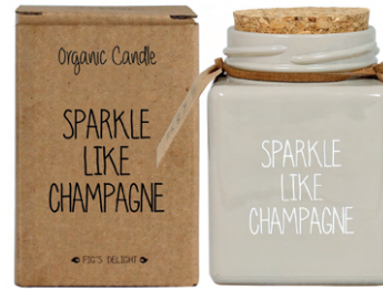
SKU: GL.SQ.SND Scent: Fig's Delight Size: L.7 x B.7 x H.9 cm Quantity: 4