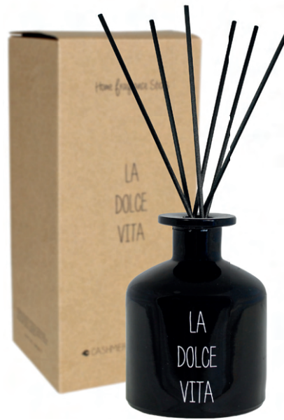
SKU: RD.XL.BL.CC.DOLCE Scent: Cashmere Comfort Content: 190 ml Quantity: 3