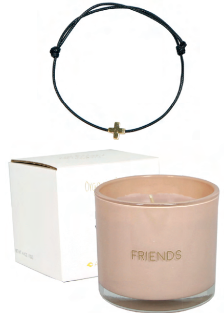
SKU: WBR.006.04 Scent: Green Tea Time Size: D.7 x H.6 cm Quantity: 4

Use this sign in your shop to show your customers which bracelet goes with which candle.