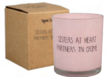
SKU: GL.CO.PI Scent: Green Tea Time Size: D.8 x H.9 cm Quantity: 4