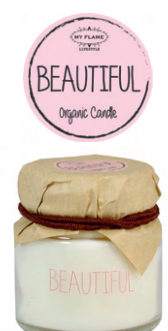
SKU: miniT.2.beau.pi Scent: Green Tea Time Size: D.4.5 x H.5 cm Quantity: 12