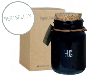
SKU: GL.MOCK.BL Scent: Warm Cashmere Size: D.5 x H.8 cm Quantity: 8