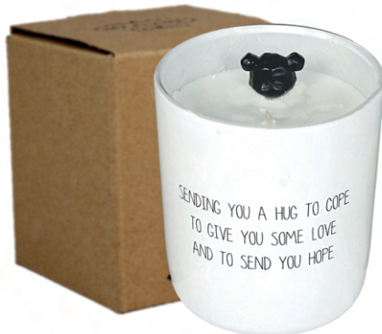
SKU: GL.BE.002.06A Scent: Fresh Cotton Size: D.8 x H.9 cm Quantity: 4