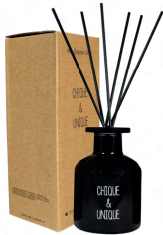
SKU: RD.BL.CC.CHIQUE Scent: Cashmere Comfort Content: 100 ml Quantity: 4