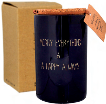
SKU: GL.RND.XMAS Scent: Winter Glow Size: D.7 x H.12 cm Quantity: 4