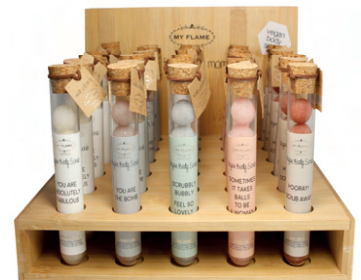
SKU: WSS.DIS.04 Space for: 6 X 5 tubes Size: W. 30 x D. 30 x H. 21 cm