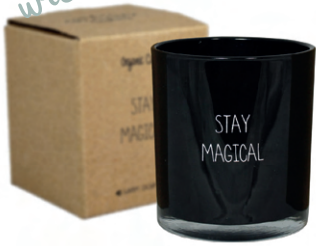
SKU: GL.CO.BL Scent: Warm Cashmere Size: D.8 x H.9 cm Quantity: 4