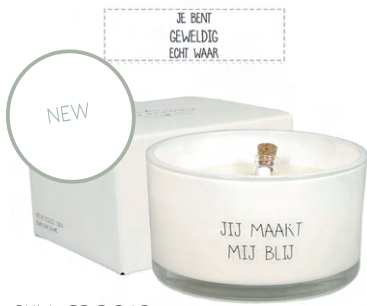
SKU: C2.2.313 Scent: Fresh Cotton Size: D.9 x H.5 cm Quantity: 4