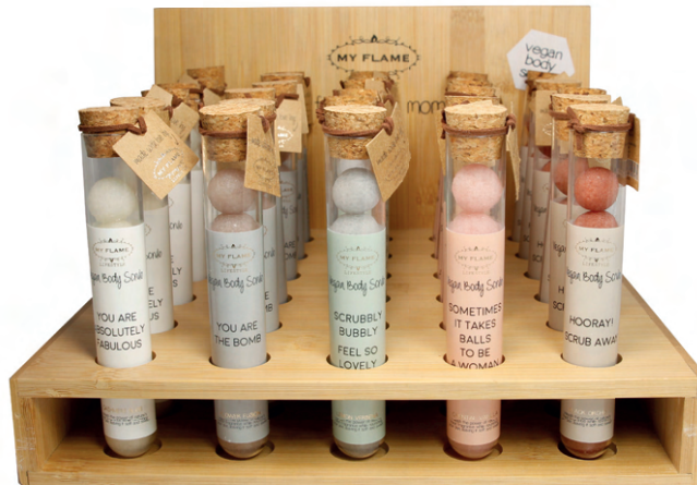
SKU: WSS.DIS.04 Content: 6 X 5 Tubes Size: W. 30 x D. 30 x H. 21 cm Quantity: 1