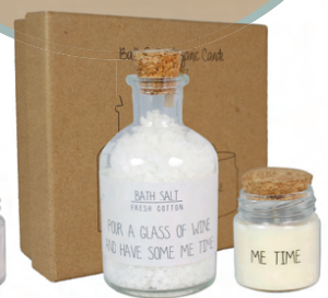
SKU: SO.BS.GB.10.WH Scent: Fresh Cotton Content: 180 gr. salt and 40 gr. wax Quantity: 4