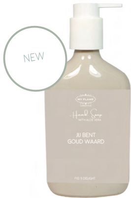
SKU: SO.GB350.SND-1 Scent: Fig's Delight Content: 350 ml Quantity: 6