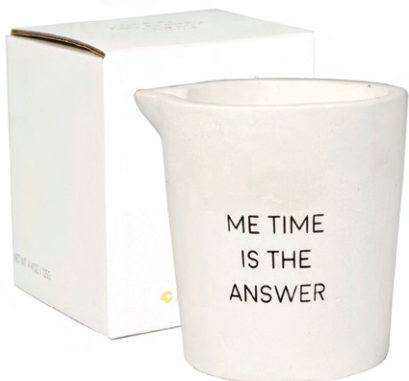
SKU: MA.016.06A Scent: Lavender Fields Size: D.6.5 x H.7 cm Quantity: 6

These candles are a blend of soy and coconut wax. The perfect fusion for a relaxing massage oil.