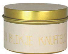
SKU: C2.2.127 Scent: Fig's Delight Size: D.6 x H.4 cm Quantity: 12