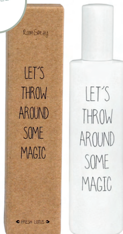
SKU: RS.WH.FL Scent: Fresh Lotus Content: 100 ml Quantity: 4