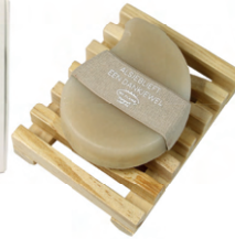
SKU: WWB.013.03 Scent: Flower Fusion Content: 128 gr. Quantity: 8