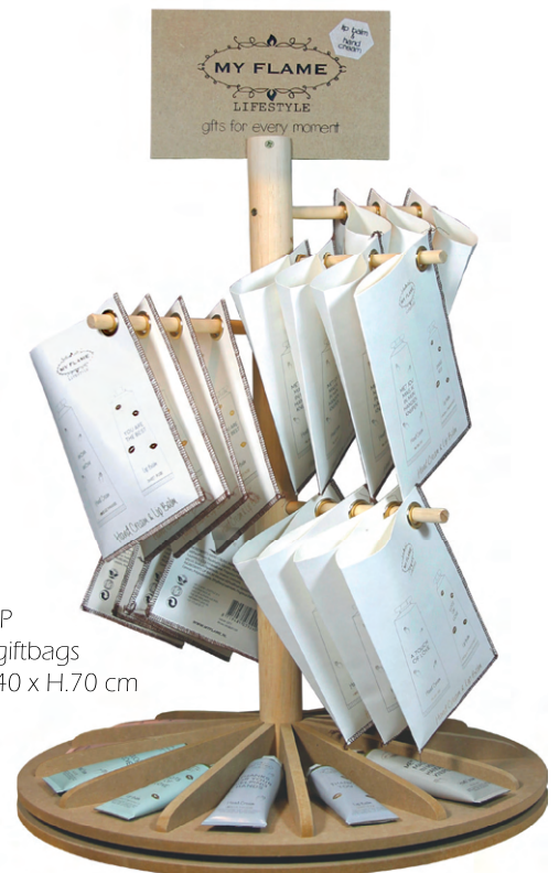
SKU: LH.GB.DISP Content: 5 x 4 giftbags Size: W.40 x D.40 x H.70 cm