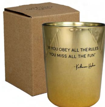
SKU: XBG.1012.SG08 Scent: Silky Tonka Size: D.10 x H.12 cm Quantity: 4