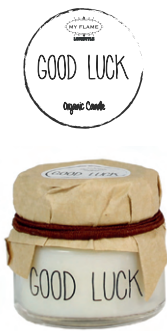
SKU: mini.3.goodluck.wh Scent: Fresh Cotton Size: D.4.2 x H.3.8 cm Quantity: 12