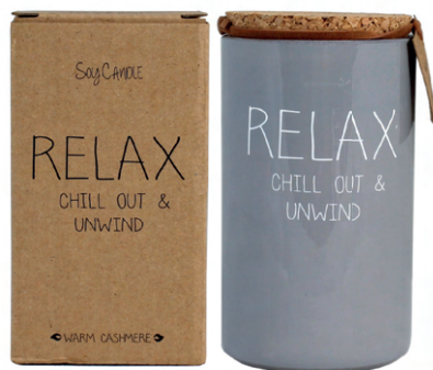
SKU: GL.RND.SD Scent: Amber's Secret Size: D.7 x H.12 cm Quantity: 4