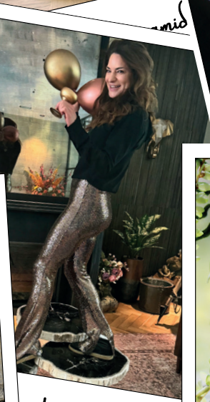
ay! - xxx -