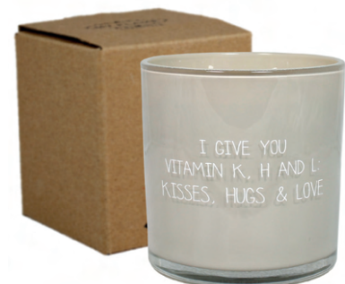
SKU: GL.1010.SND Scent: Fig's Delight Size: D.10 x H.10 cm Quantity: 4