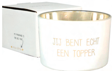
SKU: C2.2.153 Scent: Fresh Cotton Size: D.7.5 x H.5 cm Quantity: 6