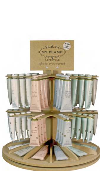
SKU: LB.HC.DIS.03 Space for: 10 x 4 lip balm, idem for hand cream Size: DIA.45 x H.50 cm