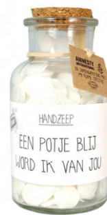
SKU: C2.2.150 Scent: Fresh Cotton Content: 50 gr. Quantity: 8