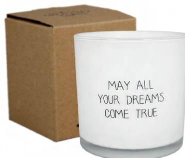
SKU: GL.1010.WH Scent: Fresh Cotton Size: D.10 x H.10 cm Quantity: 4