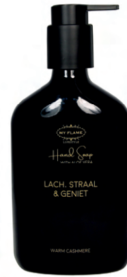
SKU: SO.GB350.BLK Scent: Warm Cashmere Content: 350 ml Quantity: 6