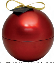
SKU: TINBALL.11.XMAS.RED Scent: Winter Glow Size: L.11 x B.11 x H.11 cm Quantity: 4