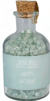
SKU: SO.BS.02.GRN Scent: Minty Bamboo Content: 180 gr. Quantity: 8