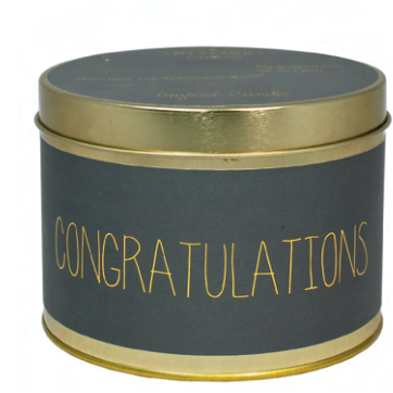
SKU: TIN.XL.DGRY Scent: Persian Pomegranate Size: D.12 x H.8 cm Quantity: 3