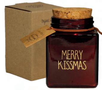
SKU: GL.SO.RED.XMAS Scent: Winter Wood Size: L.7 x B.7 x H.9 cm Quantity: 4