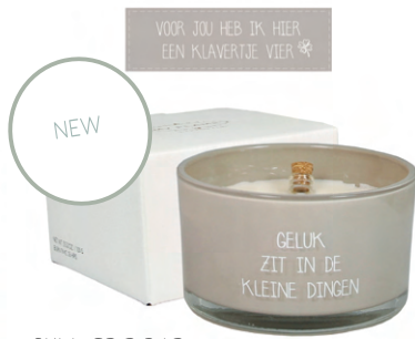
SKU: C2.2.312 Scent: Fig's Delight Size: D.9 x H.5 cm Quantity: 4