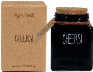
SKU: GL.SQ.BL Scent: Warm Cashmere Size: L.7 x B.7 x H.9 cm Quantity: 4