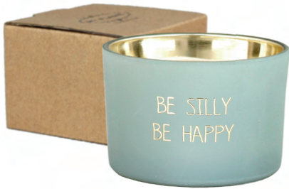
SKU: GL.MTC.XS.GRN Scent: Minty Bamboo Size: D.7.5 x H.5 cm Quantity: 6