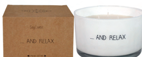
SKU: GL.XL.WH Scent: Fresh Cotton Size: D.13 x H.8 cm Quantity: 3