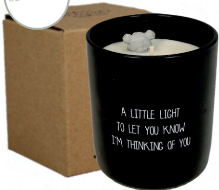
SKU: GL.BE.002.01B Scent: Warm Cashmere Size: D.8 x H.9 cm Quantity: 4