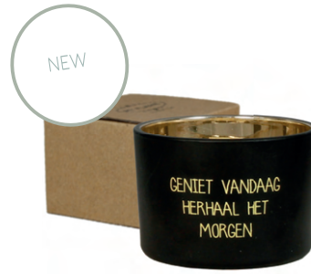
SKU: C2.2.317 Scent: Warm Cashmere Size: D.7.5 x H.5 cm Quantity: 6