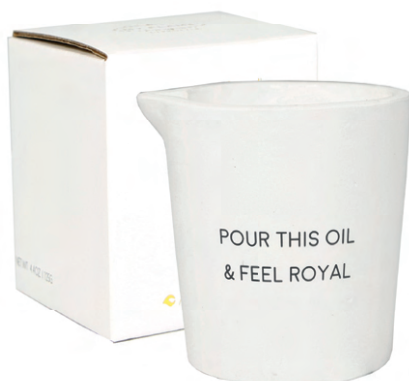
SKU: MA.016.06B Scent: Calming Sandalwood Size: D.6.5 x H.7 cm Quantity: 6