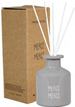
SKU: RD.XS.LG. FB.MERCI Scent: Flower Bomb Content: 50 ml Quantity: 6