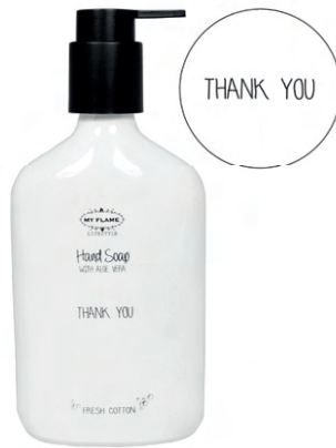
SKU: SO.GB350.WH Scent: Fresh Cotton Content: 350 ml Quantity: 6