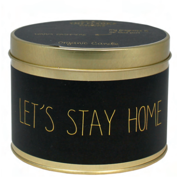
SKU: TIN.XL.BL.HOME Scent: Warm Cashmere Size: D.12 x H.8 cm Quantity: 3