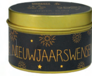
SKU: C2.2.138 Scent: Winter Glow Size: D.6 x H.4 cm Quantity: 12