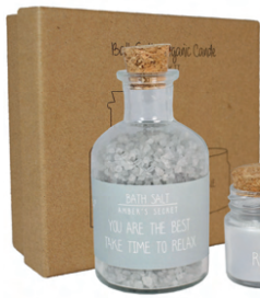
SKU: SO.BS.GB.07.LGRY Scent: Amber's Secret Content: 180 gr. salt and 40 gr. wax Quantity: 4

Run a hot bath, sprinkle the natural bath salt in the water and light the scented soy candle. The salt detoxes your body, soothes the muscles and can be used as a scrub for a radiant, smooth skin. The fragrance relaxes your mind while sharpening your mental focus. All this combined will make you feel re-born.