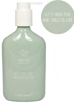
SKU: SO.GB350.GRN Scent: Minty Bamboo Content: 350 ml Quantity: 6