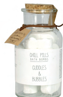
SKU: SO.BP.WH Scent: Fresh Cotton Content: 128 gr. Quantity: 6