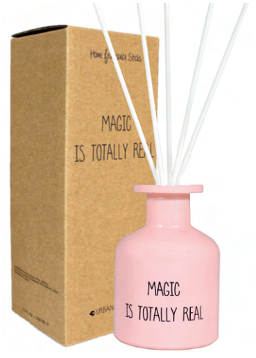
SKU: RD.PI.US.MAGIC Scent: Urban Suede Content: 100 ml Quantity: 4