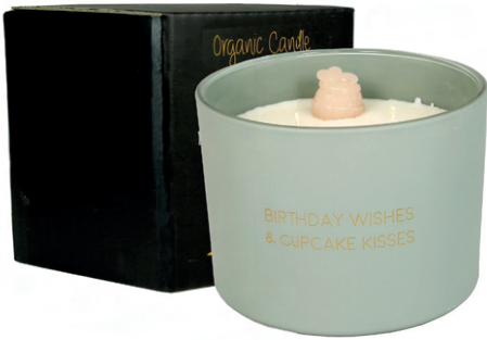
SKU: CH.017.02 Scent: Minty Bamboo Size: D.10.7 x H.8 cm Quantity: 4