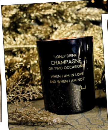
Champagne is always the