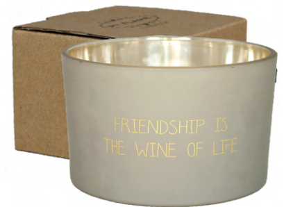
SKU: GL.MTC.XL.SND Scent: Fig's Delight Size: D.13 x H.8 cm Quantity: 4