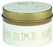
SKU: C2.2.112-1 Scent: Green Tea Time Size: D.6 x H.4 cm Quantity: 12