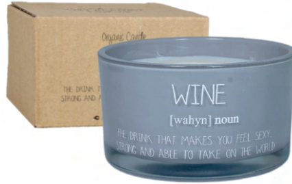
SKU: GL.WW.GRY Scent: Amber's Secret Size: D.9 x H.5 cm Quantity: 4