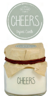
SKU: miniT.5.cheers.grn Scent: Minty Bamboo Size: D.4.5 x H.5 cm Quantity: 12