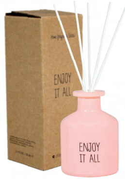
SKU: RD.XS.PI.US.ENJOY Scent: Urban Suede Content: 50 ml Quantity: 6