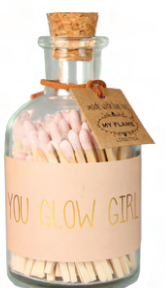
SKU: MTCH.PI Size bottle: D.6 x H.10.5 cm Content: 80 matches Quantity: 8