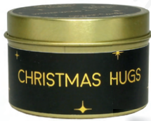
SKU: XMAS.015.01D Scent: Winter Wood Size: D.6 x H.4 cm Quantity: 12