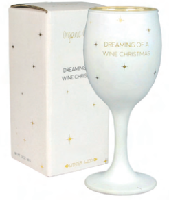
SKU: XMAS.015.06A Scent: Winter Wood Size: D.6 x H.13.5 cm Quantity: 4