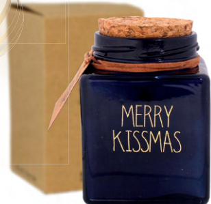
SKU: GL.SO.XMAS Scent: Winter Glow Size: L.7 x B.7 x H.9 cm Quantity: 4