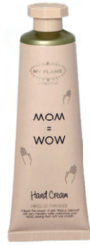
SKU: HC.009.04 Scent: Hibiscus Paradise Content: 50 ml Quantity: 8