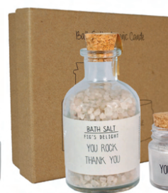
SKU: SO.BS.GB.09.SND Scent: Fig's Delight Content: 180 gr. salt and 40 gr. wax Quantity: 4