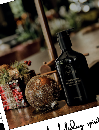
Get into the holiday spirit