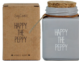
SKU: GL.SQ.LG Scent: Amber's Secret Size: L.7 x B.7 x H.9 cm Quantity: 4