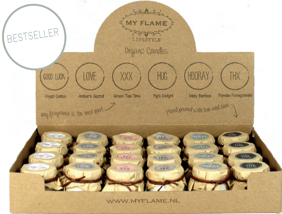
SKU: tray.24.mini Size: L.29.5 x B.20 x H.21.5 cm Quantity: 2 1 tray contains 24 candles