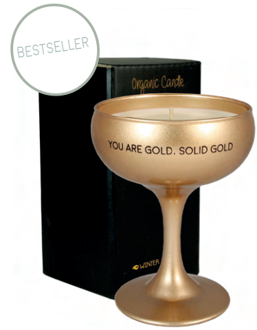
SKU: GL.WI.007.07 Scent: Silky Tonka Size: D.8 x H.11 cm Quantity: 4