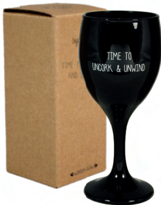
SKU: GL.WI.BL.CORK Scent: Warm Cashmere Size: D.5.5 x H.13 cm Quantity: 4