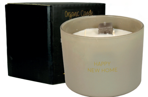
SKU: CH.017.05 Scent: Fig's Delight Size: D.10.7 x H.8 cm Quantity: 4