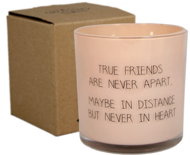
SKU: GL.1010.PI Scent: Green Tea Time Size: D.10 x H.10 cm Quantity: 4