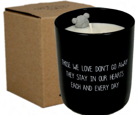
SKU: GL.BE.002.01A Scent: Warm Cashmere Size: D.8 x H.9 cm Quantity: 4