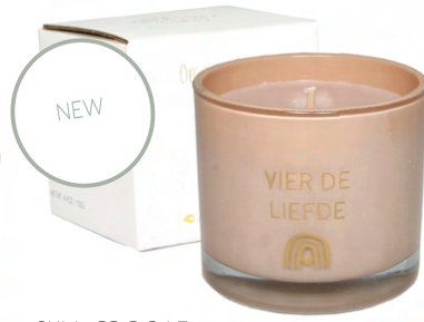
SKU: C2.2.315 Scent: Green Tea Time Size: D.7x H.6 cm Quantity: 4