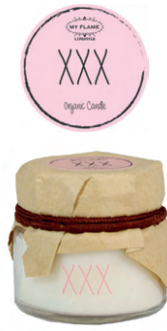
SKU: mini.2.xxx.pi Scent: Green Tea Time Size: D.4.2 x H.3.8 cm Quantity: 12